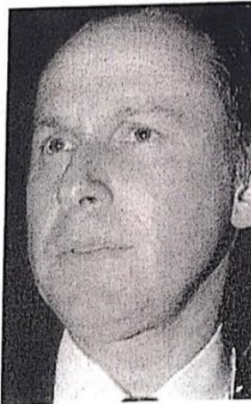
MANUEL ELKIN PATARROYO

Although some international laboratories were interested in the vaccine, he did not sell it ; instead, he donated it, in the